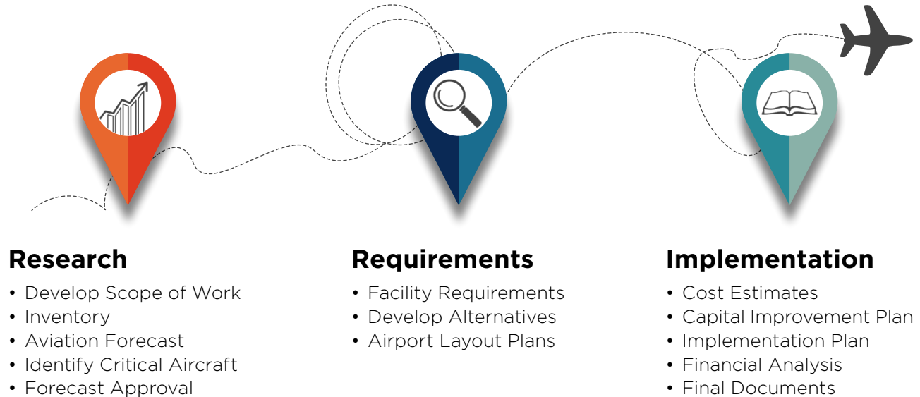
Figure 2.2: Airport Master Plan Process

While the elements of an airport master plan are guided by the FAA, they vary in detail and complexity depending upon the size, function, and issues of each airport. As shown in Figure 2.2, these elements build upon each other throughout the planning process.