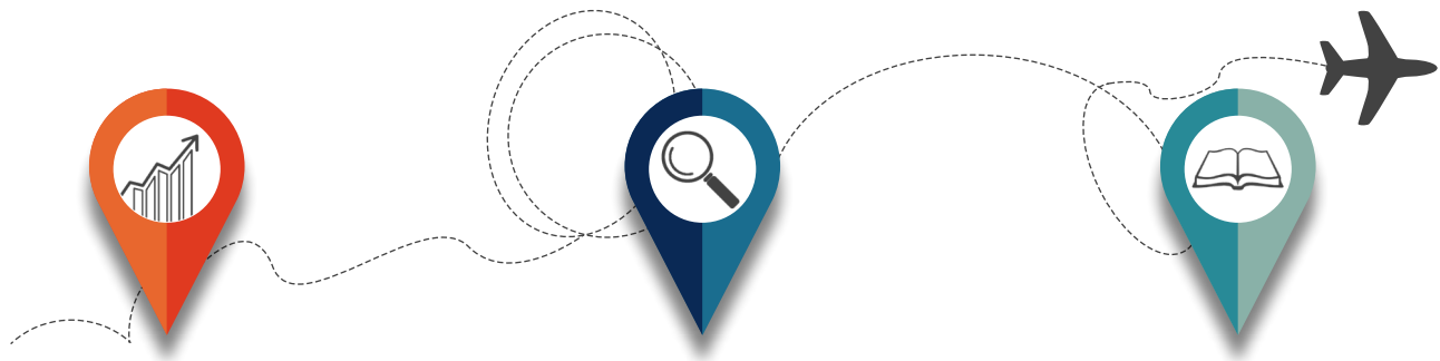
Figure 2.2: Airport Master Plan Process

While the elements of an airport master plan are guided by the FAA, they vary in detail and complexity depending upon the size, function, and issues of each airport. As shown in Figure 2.2, these elements build upon each other throughout the planning process.